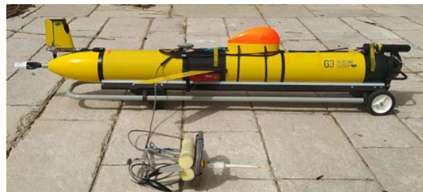
Fig 1. The TWR Slocum glider with the USBL/Modem payload (centre) and the radioactivity sensor (front). A floating Wi-Fi access point allows for real-time glider debugging while underwater

Radioactivity measurement payload. The main radioactivity sensor is based on a small-factor gamma spectrometer with a 4 cm 3 CZT crystal. The stand-alone instrument is protected from the elements with a 600 m depth rated hard anodized aluminum 6082-T6 pressure tolerant housing. Data and power provided via USB with one underwater connector. A ROS wrapper driver has been developed that allows data storing and parameters initialization for ARM based single-board computers. The \gamma Sniffer has been independently tested in the Kolumbo (Greece) hydrothermal field, at 500 m depth.