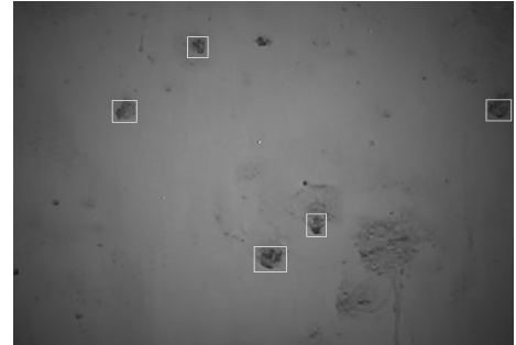
Fig 1. Image showing the inferred burrows.

Afterwards, small, medium and large YOLOv5 architectures (YOLOv5s, YOLOv5m and YOLOv5l) were trained with the train dataset fine tuning the hyper-parameters with the validation dataset. Then, the quality of each model was assessed on the test dataset. The evaluation was performed on a standard laptop computer (i7 CPU at 2.9 GHz) equipped with a NVIDIA GeForce GTX 1650 and using torch-1.11.0+cu113 over Ubuntu 20.03. Table 1 summarizes the results. Even though the larger the model the slower the inference, the resulting quality is almost identical, being close to a mean Average Precisions (mAP)@0.5 of 0.8 and a mAP@0.5:0.95 of 0.4 in all cases. Figure 1 shows a sample image where inferred burrows appear in squared bounding boxes.