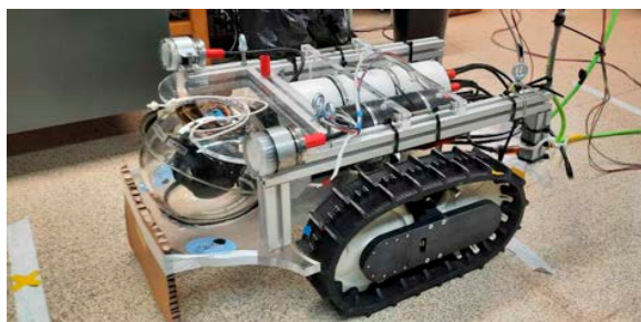
Figure 2 Crawler and measuring marks (white tape) on the floor

To tackle this issue and compensate for the speed discrepancy between the two motors, the PWM signals applied to each motor were calibrated. For this purpose, the PWM applied to one of the motors was considered as a reference (in our case, right motor and PWM1). The PWM applied to the other motor (left motor and PWM2) was consequently calibrated in both forward and backward direction (Figure 2).