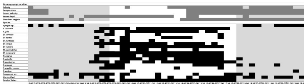
Fig. 2. Integrated chart of significant daily increases in measured values for the 5 biologically relevant oceanographic variables, and visual counts of the 17 taxa, unclassified and total fishes obtained from 1 st of December 2016 to 31 st March 2017 of continuous measurement by the EGIM sensor infrastructure in front of the OBSEA (dark gray horizontal bars report values above the MESOR for the oceanographic measures, while black horizontal are used for visual counts). With light gray boxes in background is showed the duration of the night hours.