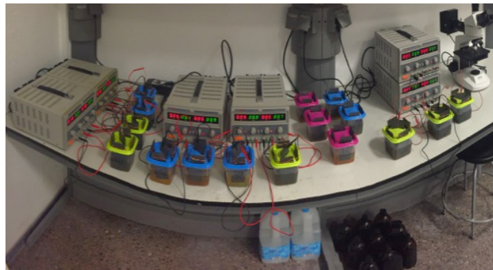
Figure 1. Experimental setup in laboratory.

The progression of corrosion was evaluated in two ways: i) by measuring the mass variation due to the corrosion phenomenon, which was subsequently used to determine the kinetics of the reaction, and ii) visually, by using free software ImageJ. The combined effect of the three variables was analyzed using the Statistics software, performing a factorial analysis in order to obtain response surfaces and their corresponding predictive equations, which allow predicting the effect of corrosion. Finally, in order to observe the differences between the model obtained and the degree of actual corrosion, both steel types were subjected to the effect of seawater from the dock of the Naval Academy.