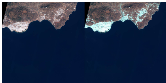
Fig 7. Neural network result.