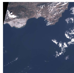
Fig1. RGB composition from Sentinel 2, Almería, 100 Mpx, 10 m/px (100x100 Km2).

where authors recommend a combination of two indexes. Testing this method on the former image, we get this result (figure 2).