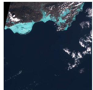
Fig3. Bands 8 & 9.

Combining these methods with a cloud detection method [9] and discarding the land areas with the help of maps, we could meet the purpose. However, in next section we will see more powerful tools that getting better results more directly.