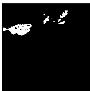
Fig 5. Truth table.

Training has been successful, obtaining an error rate of 2%, see figure 6 (confusion matrixes) and figure 7: recognition result on a different image of the same place (to demonstrate generality of method).