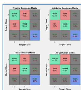
Fig 6. Confusion matrixes.