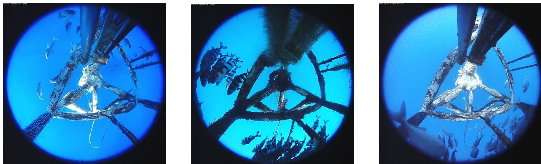
Fig. 2. Pictures taken by the fisheye IP camera attached to the oceanographic buoy showing schools of rudderfish ( Centrolophus niger , left and right) and pilot fishes ( Naucrates doctor , center).

Since 2014, OOCs provides information to global marine networks such as MONGOOS ( http://oceanobs.mongoos.eu/ ) fuelling operational models of the NW Mediterranean (e.g. IBI-ROOS) predictions. The Station is also a component of the EMODNET ( http://www.emodnet-physics.eu/portal/ ) and COPERNICUS ( http://marine.copernicus.eu/ ). These networks are of public access and make available in-situ information for modelling hindcast and forecast providing a social service regarding e.g. the marine weather conditions or the expected circulation pathways in case of environmental emergencies, related to the field of operational oceanography.