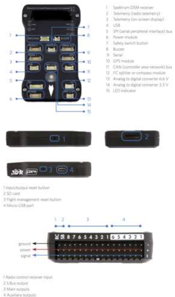
Fig.1. Flight control's connections.