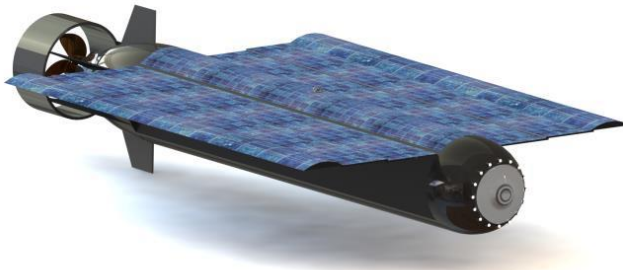
Figure 1 Panel solar

Nowadays, typical missions of autonomous submarines are searching mines or checking submarine wire. However, these missions need supporting boats due to low autonomy of these submersibles. One of the competitive characteristics of SIRENA is the long duration of its missions. This is due to its solar panels illustrated in the Figure 1, capable of recharging the batteries. For these missions, SIRENA would assure performing these tasks with a low logistic cost.