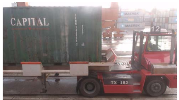
Fig. 1. Example container photo, taken at the terminal.

Keywords: container, handling, machine vision, mathematical morphology, O.C.R.