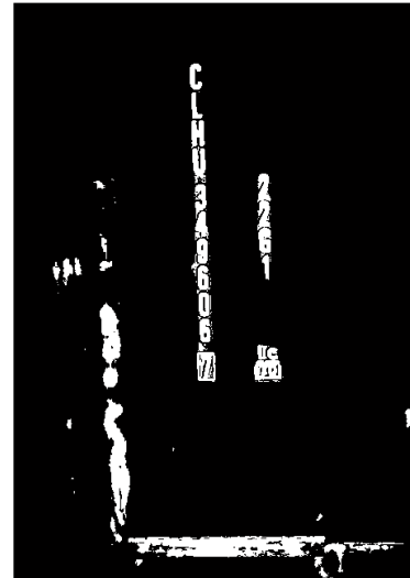
Fig. 5. Binarization: threshold is computed to yield 5% of pixels white.