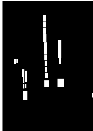
Fig. 6. Pre-segmentation: ROI's suspicious of being legitimate characters are selected to be checked by O.C.R.

The last image (figure 3, right) defines some rectangles that are “possible characters”. Now, we must crop the corresponding sub-images from the enhanced ROI (figure 2, right) and a O.C.R. must determine if we have a true character and, in that case, recognize it. This process is aided by the fact that the true characters are always lined up (horizontally or vertically), making possible to remove some false ones now.