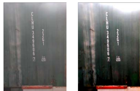
Fig. 2. ROI: original (left) and enhanced (right).

In figure 2 (left) we can see the original image cropped to the defined ROI (defined for a 40 feet container from lateral camera). In the right we can see the same image where we have made a contrast enhancement via an automatic histogram stretching [3].