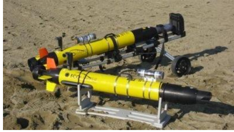
Fig. 1. The two OceanServer AUVs owned and operated by CSIC's Marine Technology Unit. One is equipped for seafloor imaging (front) and the other for water quality monitoring (rear). Both are provided with a SonTek DVL/ADCP sensor.

scan sonar, optical cameras and a CTD. The Ecomapper version mounts an YSI multi-parametric sensor capable of measuring different biogeochemical parameters such as PH and Chlorophyll. These AUVs can perform continuous surveys down to 100 m depth for about 10 h at speeds ranging from 1 to 4 knots.